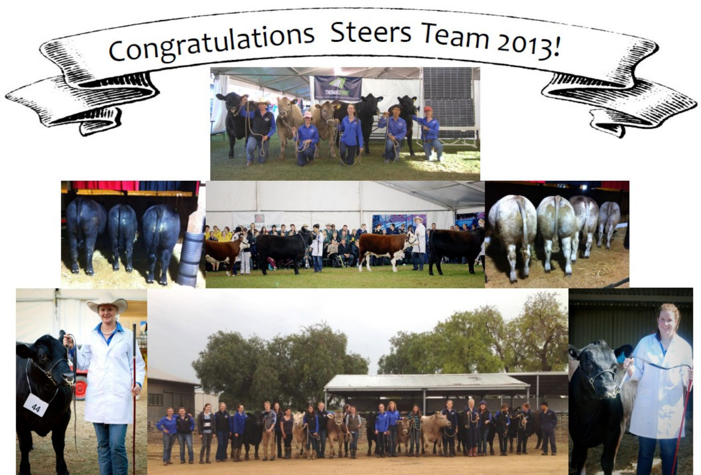
Congratulations to the Steers Team for their group and individual achievements in the Gawler and Royal Adelaide Shows.

Please like the R.A.C.S.U.C. facebook page a keep an eye out for more details! Or for more information please contact RACSUC on racsuc@adelaide.edu.au