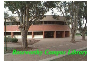
Roseworthy Campus Library