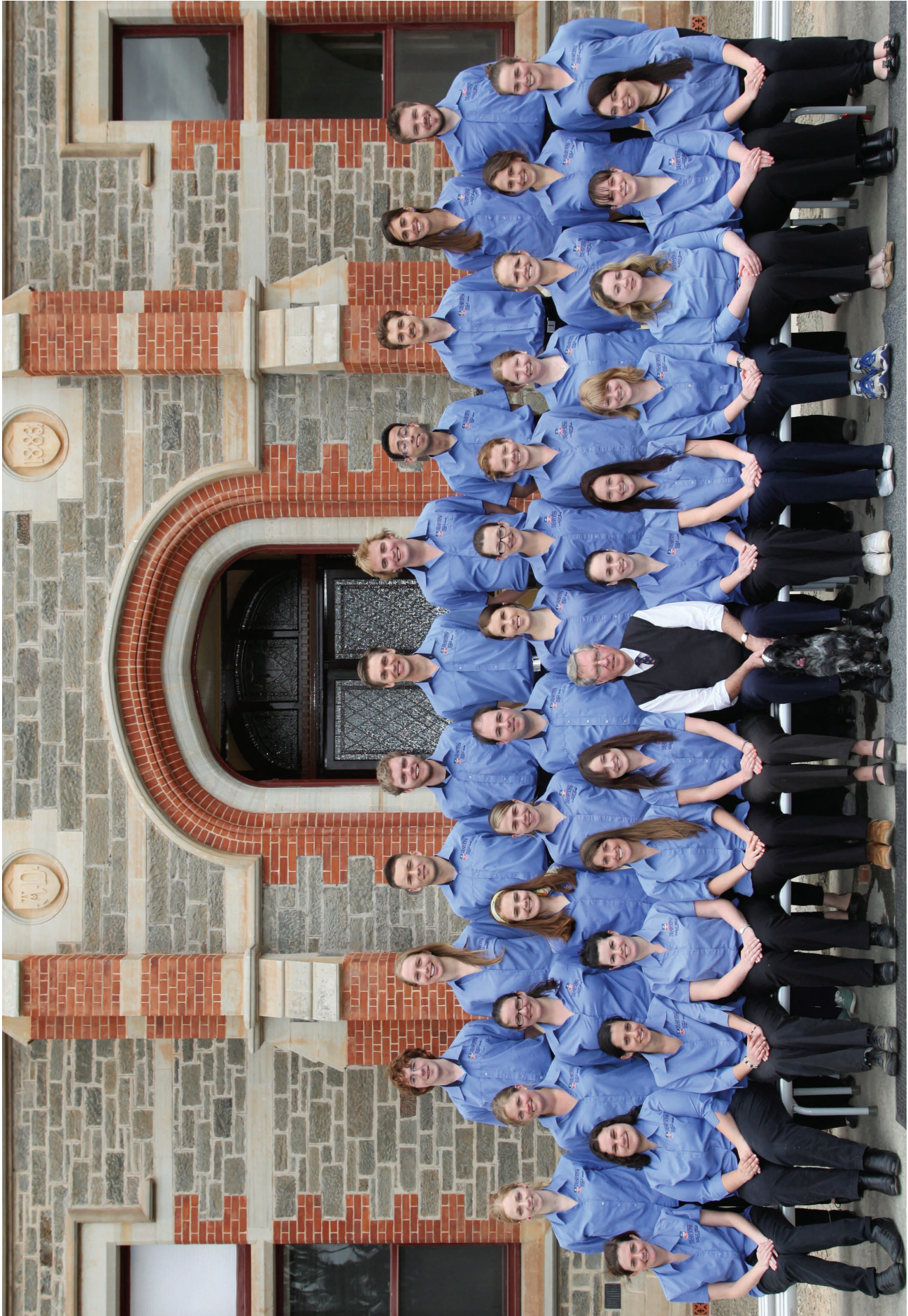
Congratulations to our first graduating class of Doctor of Veterinary Medicine students!