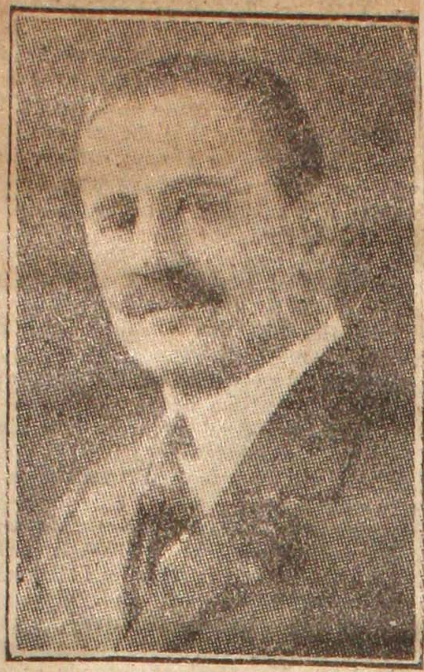
SIR HUGO HIRST, prominent industrialist in Great Britain and an advocate of Empire preference.