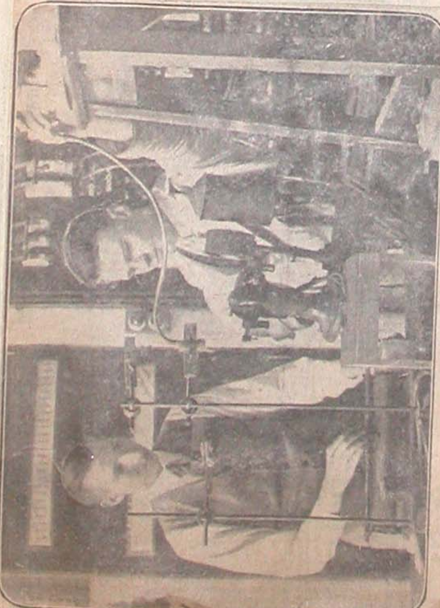
PRINCIPLE OF THE CINEMATOGRAPH was demonstrated at the free physical science lectures at the University yesterday. Two students working on the apparatus.