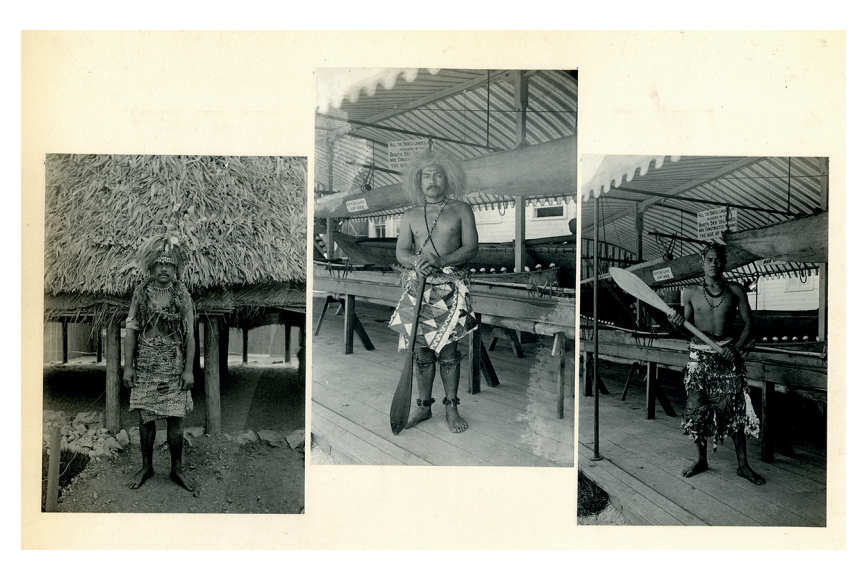
Figure 49. Photographs of men from the Samoan Village taken at the Columbian Exhibition, Chicago, 1893.