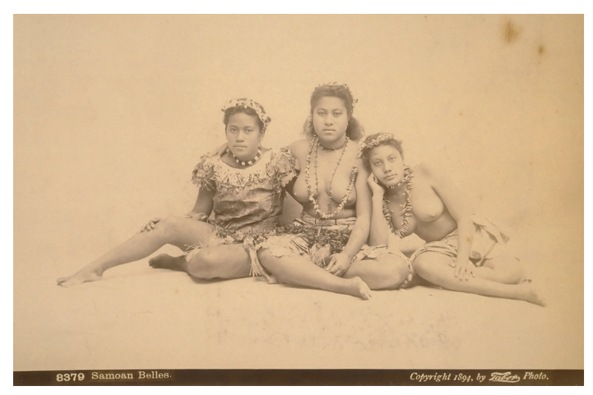
Figure 51. 'Samoan Belles'. Mid-Winter Fair, San Francisco, 1894. Call number: 10015235.