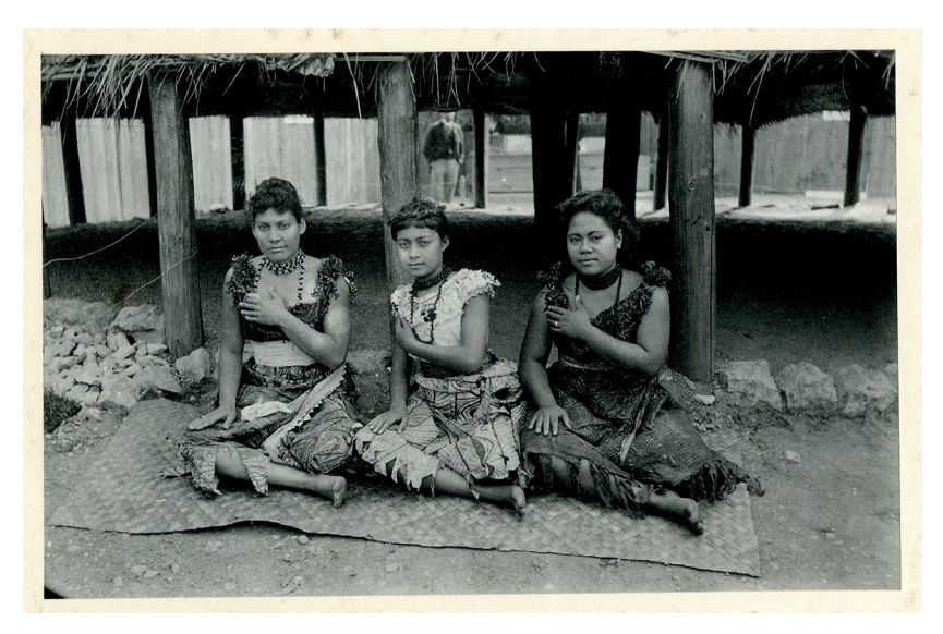
Figure 50. Photograph of women from the Samoan Village taken at the Columbian Exhibition, Chicago, 1893.