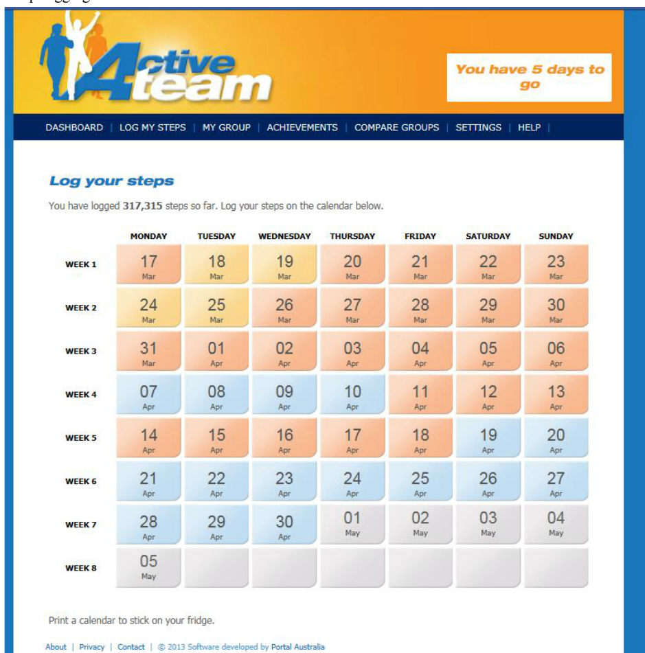
Figure 1. Active Team step-logging calendar.

Following consideration of numerous behavior change theories, the theory of planned behavior [22,23] and fun theory [24] were selected to inform development of the content and features of Active Team. The theory of planned behavior posits that a person's decision to perform a particular behavior is influenced by three factors: attitude, subjective norms, and perceived behavioral control [22,23]. Fun theory advocates that people will be more motivated to do routine activities if they are adapted to be fun [24]. The Active Team app attempts to address each of these factors by providing daily tips for physical activity, written by a comedian (theory of planned behavior—attitudes and perceived behavioral control; fun theory); use of teams for peer encouragement and support (theory of planned behavior—subjective norms; fun theory); and setting small achievable goals (ie, daily step count), which are recorded and contribute to a long-term/overall goal (500,000 steps) (theory of planned behavior—attitude and perceived behavioral control), unlockable awards, named by a comedian (fun theory), and the ability to send virtual gifts, such as a high five and a pink leotard (theory of planned behavior—subjective norms; fun theory).