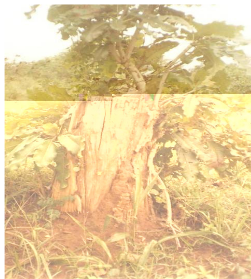
Figure-2 Shea coppices sprouting on a stump attacked by termites

respondent do not influence people's willingness to plant shea trees. It means that the local people would not be influenced by these factors in order to be able to plant shea and other indigenous trees. Therefore, any tree planting program in the region should consider factors such as marital status and land ownership before its implementation in the area.