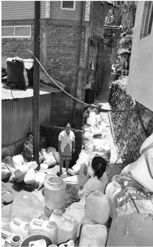
Figure 10.3 Waiting for Water at Jawahar Busti