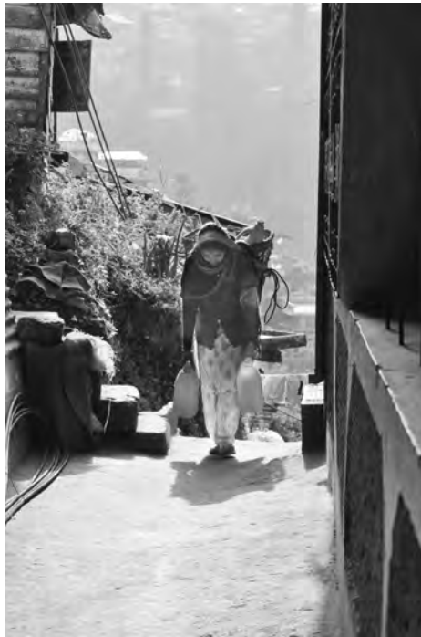
Figure 10.1 A Darjeeling Resident Manually Carrying Water while Walking Past Water Pipes

With these observations in mind, we suggest that there are ecological factors that play into Darjeeling's water stress but that, to a large extent, the issue of inadequate water supply is in part a manufactured crisis. 12 In saying this, we assert that the resource management system in place has exacerbated a schism between those who have access to water and those who do not (Figure 10.1). Such schisms reflect the overall