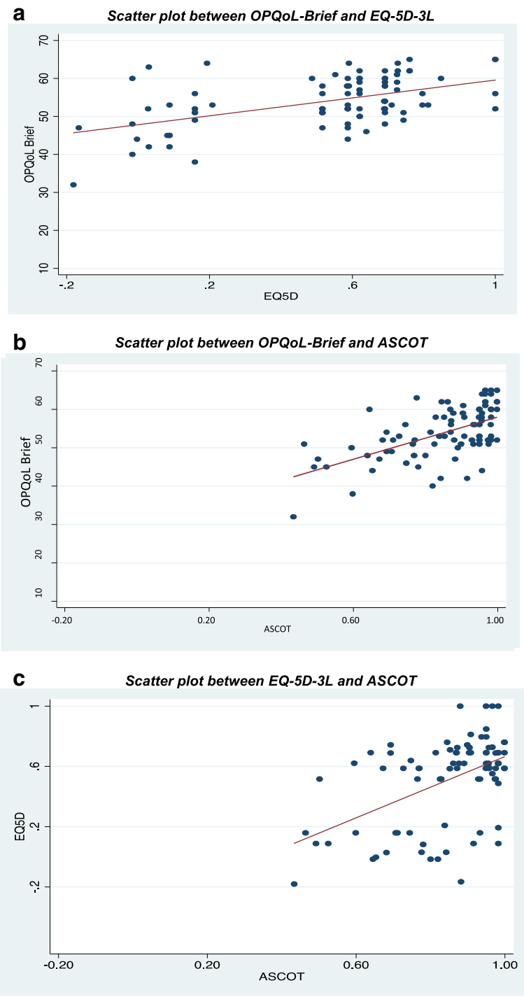
Fig. 1 a Scatter plot between OPQoL-Brief and EQ-5D-3 L. b Scatter plot between OPQoL-Brief and ASCOT. c Scatter plot between EQ-5D-3 L and ASCOT

ASCOT and r = 0.50 for EQ-5D-3 L versus ASCOT. Our hypothesis that the highest level of agreement would be seen between the OPQoL-Brief and ASCOT was accepted. The plots also show that more individuals reported themselves to be in the best state (according to the descriptive