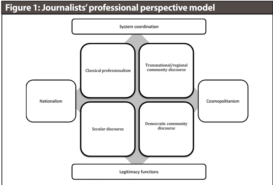
Note: This matrix provides a context in a regional (European) public sphere such as European Union (Heikki Heikkilä & Risto Kunelius, 2006)

In a sense, Heikkilä & Kunelius (2006) gave a context of journalists’ perspectives to cover a region like the EU. This considers the editorial dispositions of journalists originating from a geographic region and those outside of that region in their approach to events and news coverage. This paper builds from this model and looks into operational measures of how a geographic region’s journalists (as well as journalism schools) consider reporting about Southeast Asia under the ambit of regional integration.