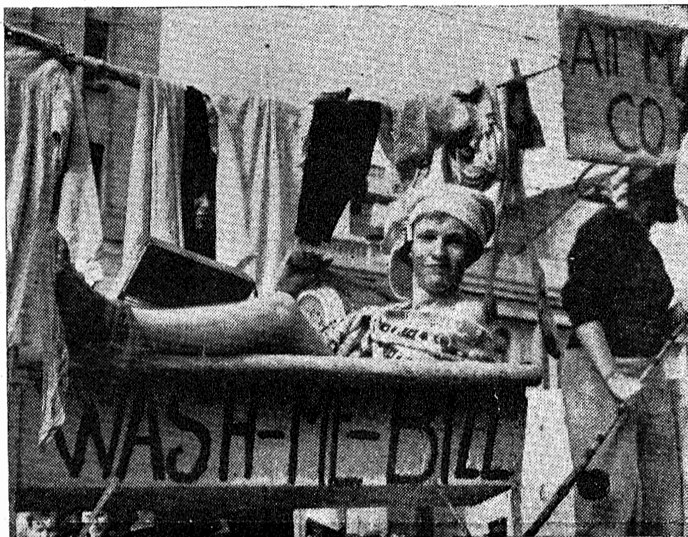
Maybe you're wondering why this block is published again — well look at the poster and remember it tomorrow when you write yours.

The Hop should be the usual roaring success, with