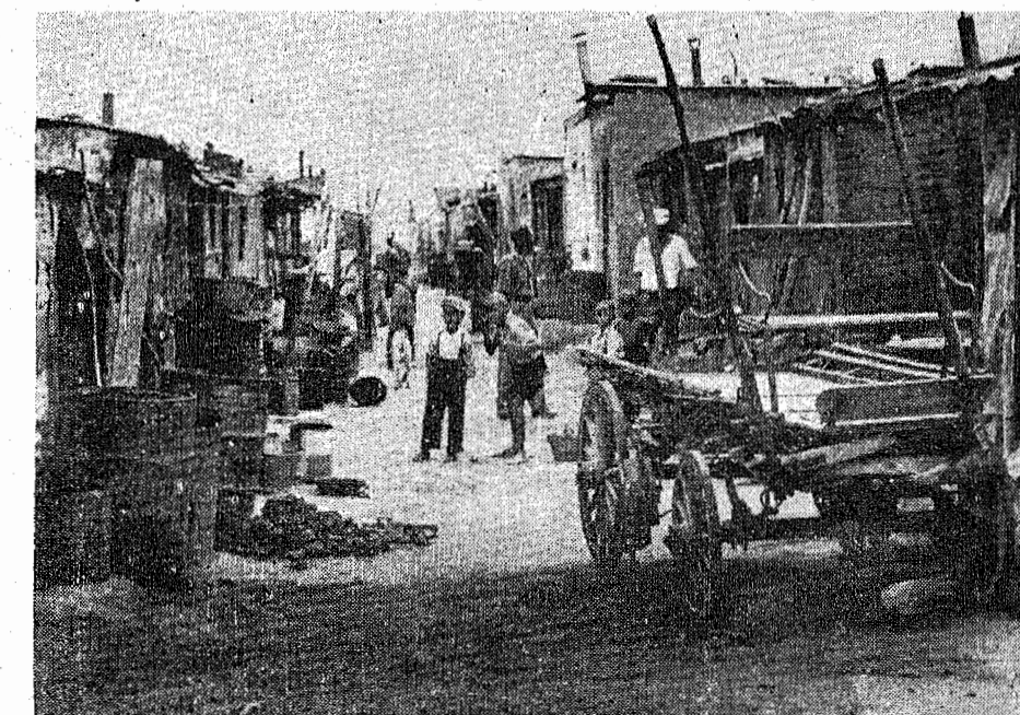
"Sophiatown"—the old native quarter of flourishing Johannesburg.

In Johannesburg, a city with one of the highest standards of living in Africa, where the minimum required just to sustain a family