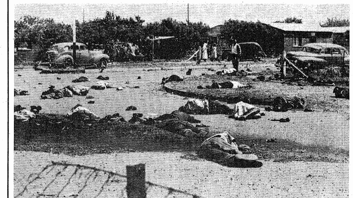
The forecourt of the Sharpeville Police Station strewn with bodies after police had opened fire without orders on a peaceful crowd of unarmed natives demonstrating against pass laws. After about 72 were killed and hundreds wounded police used armoured cars to disperse the crowd.