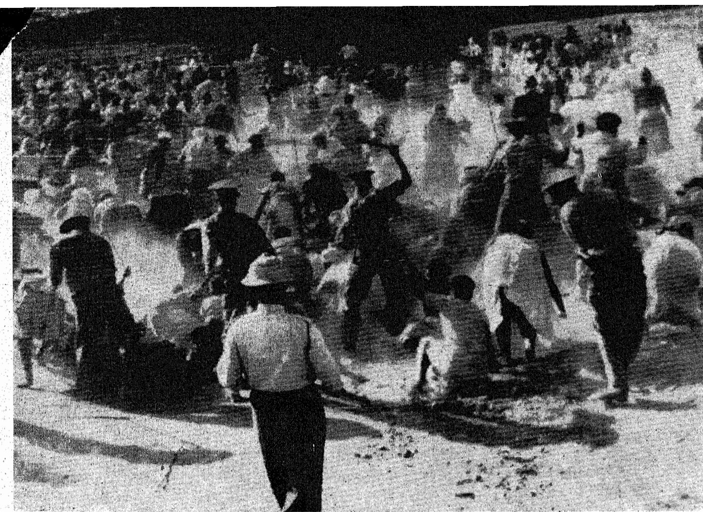
Police baton charge African women—they later opened fire with sten guns and rifles.