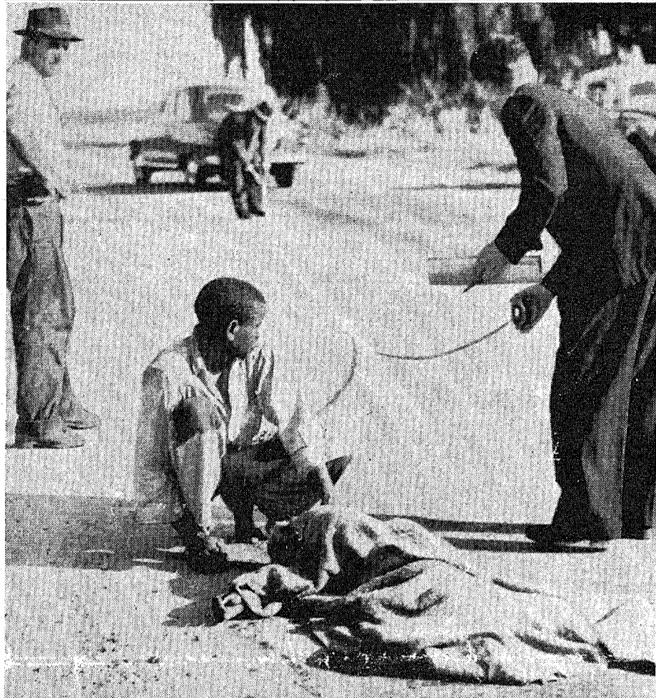
A badly injured seven-year-old native child lies on a road in Johannesburg after having been hit by a lorry. Beside him squats his father. For 45 minutes the boy lay huddled in the sun before he was taken to hospital in a press photographer's car. Ambulance services in the South African city are run on a "whites only" basis.