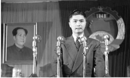
Rong Yiren, 1951

others as role models. In 1951, he reputedly tried to formally join the CCP but was told by Mayor Chen Yi 陈毅 that he would be more useful as a non-member. Rong was protected during the Cultural Revolution by Premier Zhou Enlai 周恩来 — a sure sign of his privileged status, and was quickly ‘rehabilitated’ in the Deng era. He did secretly join the CCP in 1985, although this was only revealed after his death. 5