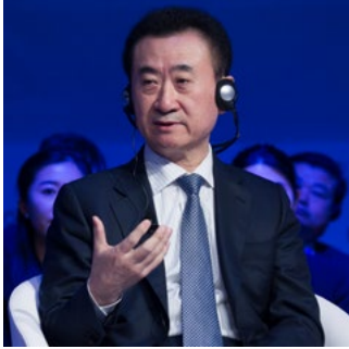
Wang Jianlin, January 2017

Numerous Chinese nationals launched court cases against Guo. Among them was a vice-minister of housing, who sued him for $US10 million for alleging that she traded in sexual favours and was corrupt; 16 a hedge fund for US$88 million for defaulting on debts and seeking a restraint over his US$68 million New York apartment; 17 and actress Fan Bingbing 范冰冰, who threatened to sue over his claims that she had slept with Wang Qishan. 18