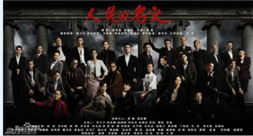
Promotional material for In the Name of the People

In November 2017, a lawsuit ensured that this drama remained in the limelight. An accusation was made that one of its main plots was plagiarised from a former journalist's publication in 2010, as the two share similar scenes of worker protests, government regulation, and gangster interference surrounding the selling and reform of an SOE. The scriptwriter for In the Name of the People denied the accusation, making the point that this particular plot is typical of Chinese enterprise reform during past decades. While the outcome of the lawsuit is still pending (at the time of publication), it's hard to argue with this point.