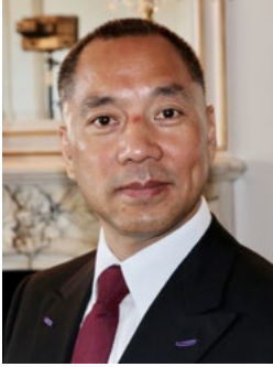
Guo Wengui

hunter' 权力猎手 for his corruption and shady links with officials. 9 Once in exile, Guo made an escalating series of claims about corruption by others, particularly Wang Qishan 王岐山, the Secretary of the CCP's key anti-corruption body, the Central Commission for Discipline Inspection. Guo, who paints himself as a patriotic whistleblower, has insisted that he is only trying to support Party General Secretary Xi Jinping's anti-corruption campaign.