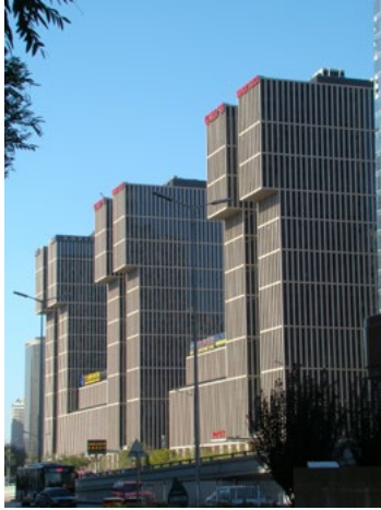
Beijing Wanda Plaza (headquarters for Wanda Group and Wanda Cinemas)