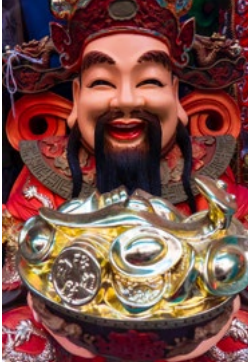
Caishen: The God of Wealth

For centuries, many Chinese prayed to Caishen 财神, the God of Wealth, to prosper and preserve their wealth. Fortune was hard won but easily lost, often thanks to arbitrary seizure by rapacious officials in imperial times, through to the Republican Era (1912–1949), and especially during socialism under Mao (1949–1976). As Xiao’s case shows, it remains so. As a result, the wealthy have long seen the need to use their wealth to accrue status, social capital, and political connections to protect themselves.