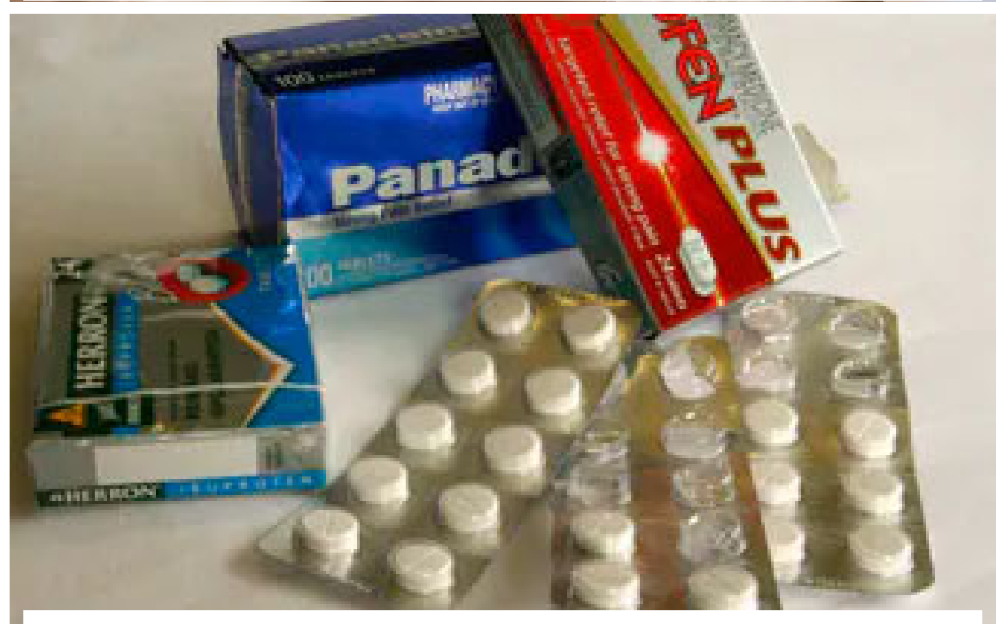
Three claims used to justify pulling codeine from sale without a prescription, and why they're wrong