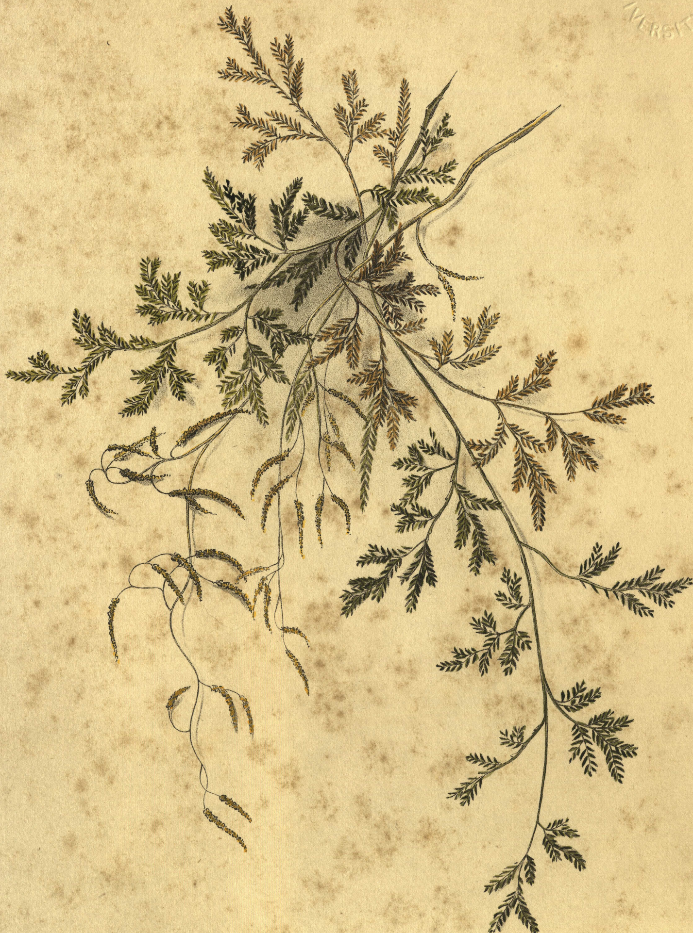
Lycopodium Billardieri, varium

This specimen is from the Dun Mountain Line, Nelson. It is frequently of a lovely golden colour.