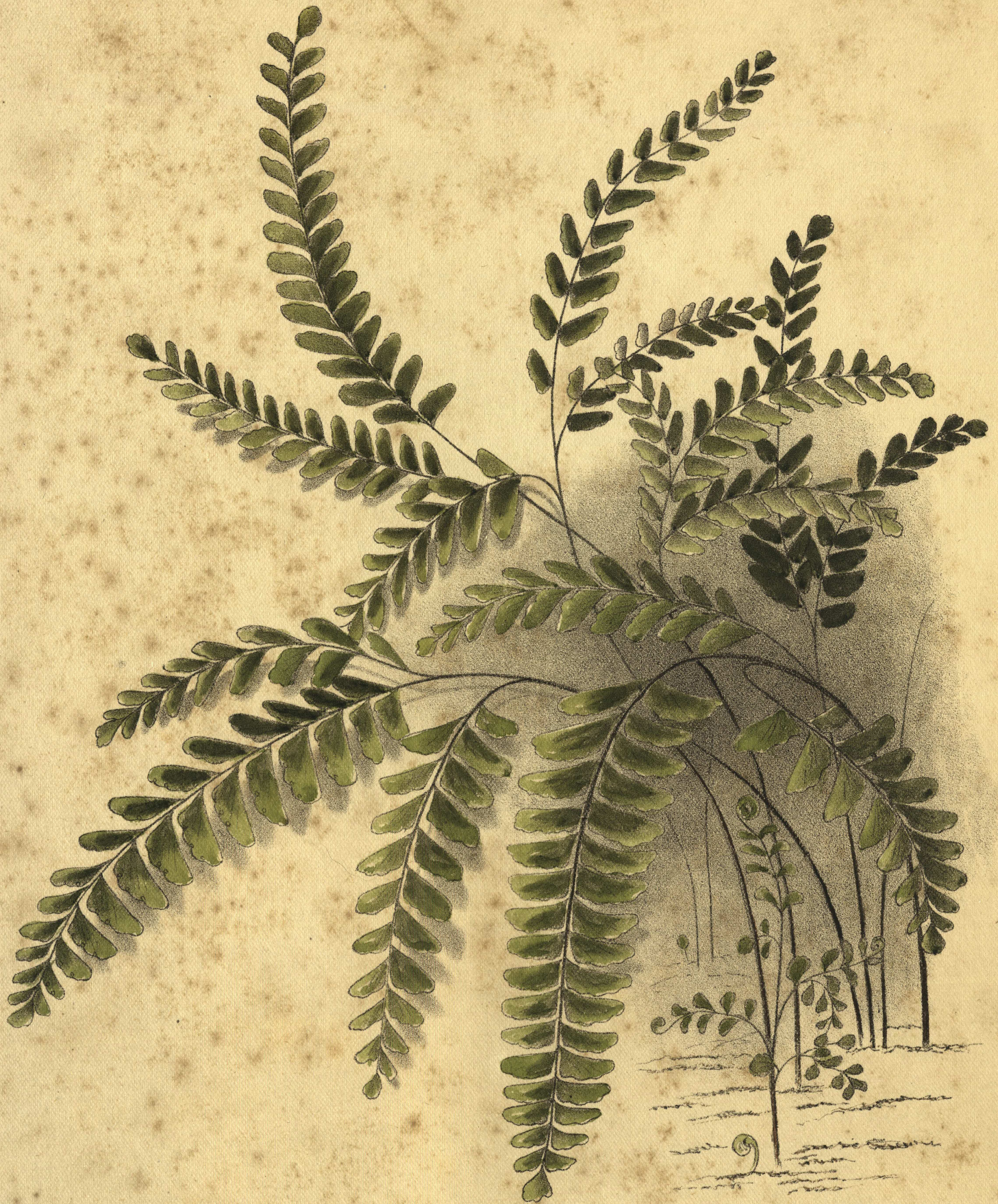
Adiantum Cunninghamii (Maiden Hair)

Growing in dense woods and damp places A large tropical and temperate genus.