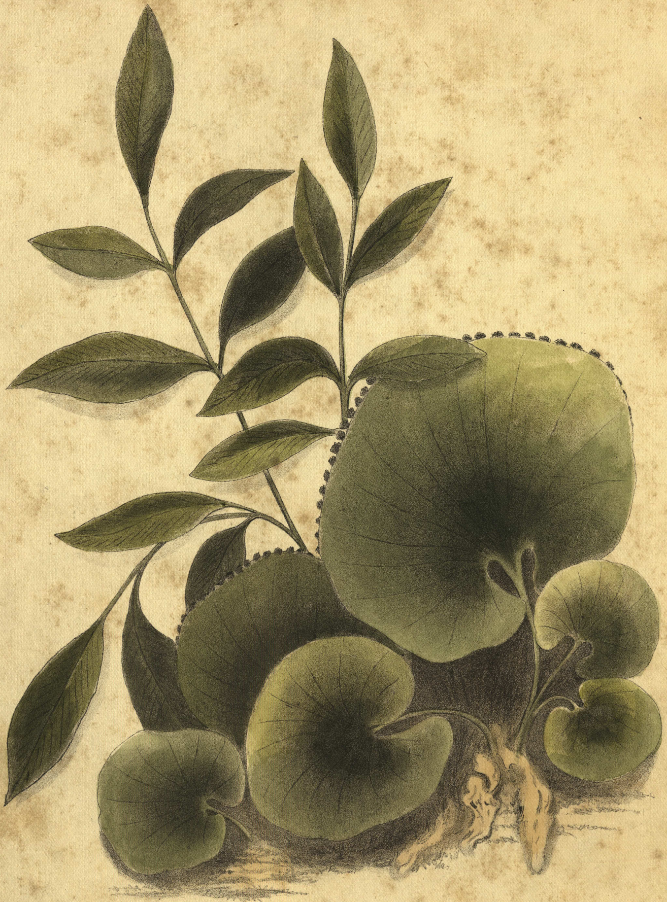
Trichomanes reniforme (Kidney fern.)

Abundant in forest of both Islands, growing on damp and rotten logs. Fronds nearly transparent when fresh. One of the most beautiful and singular ferns; confined to New Zealand.