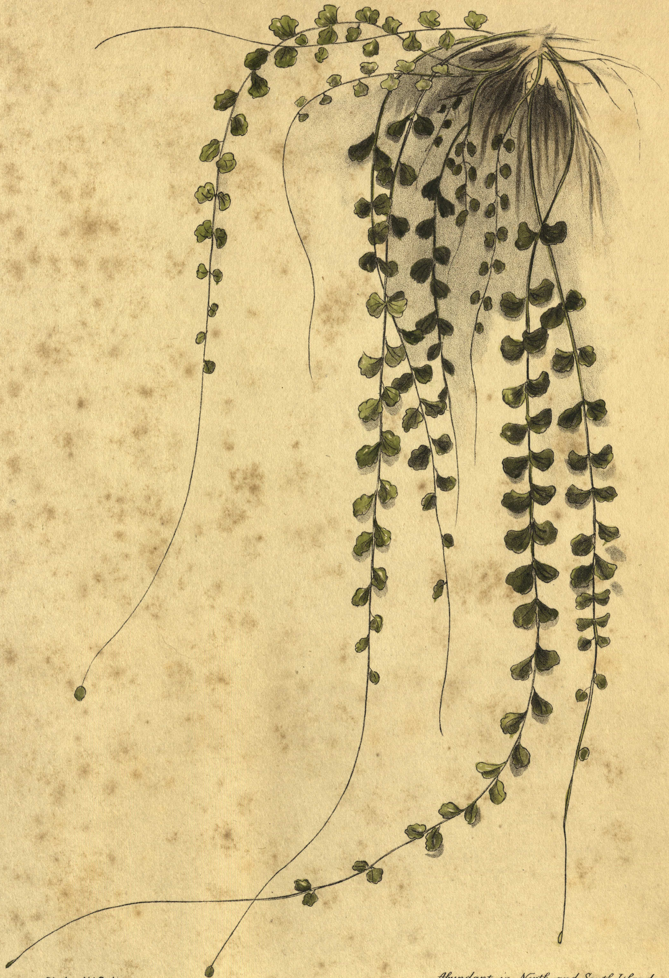
Asplenium flabellifolium (Whip-cord)

Abundant in North and South Islands growing on Rocks and stony places, also in Australia and Tasmania.