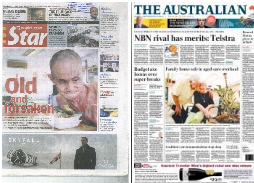
Figure 5: Front pages of The Star (2012) and The Australian (2012)

Media reproduce and proliferate stereotypes about the ageing and the elderly. Below are images of front pages from both countries' datasets. The rationale to use these two front pages lies in the fact that they provide a typical portrayal of the elderly in both countries. The images possess striking differences in the construction of identities for the elderly. Older people in Australia are portrayed as affluent and asset-rich, while their Malaysian counterparts are portrayed as the opposite.