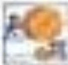
Small caption text below the image.

Telstra has said it will support the National Broadband Network (NBN) but believes it has merits that should not be overlooked.