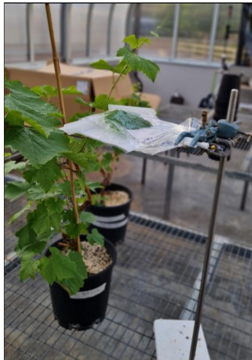
Figure 1. In situ VOC sampling of V. vinifera L. cv. Shiraz potted vine. Volatiles from an intact leaf were collected in a fluorinated ethylene polymer (FEP) gas sampling bag fitted with a PTFE valve and septum port for SPME sampling. Filter paper loaded with d_6 -1,8-cineole solution was included in the bag as an internal standard.

To ensure minimal handling of the plants, volatiles from plant leaves were collected in 1 L fluorinated ethylene polymer (FEP) gas sampling bags (FEP 31C_1 L, HedeTech Co., Ltd., Dalian, Liaoning, China) fitted with a PTFE valve and septum port used for SPME sampling (Figure 1). The concentrations of pre-selected compounds ( \alpha -pinene, isoprene, (Z)-3-hexen-1-ol, MeSA, and MeJA) were determined in the different treatments at drought initiation, peak drought, and after re-watering (recovery). For each treatment, a leaf was placed in the sampling bag containing a 4.25 cm Whatman filter paper loaded with 20 \mu\text{L} of a 120 \mu\text{g L}^{-1} d_6 -1,8-cineole solution. The bag was sealed firmly without detaching from the plant and the SPME fibre inserted into the septum was exposed for 50 min prior to GC-MS analysis.