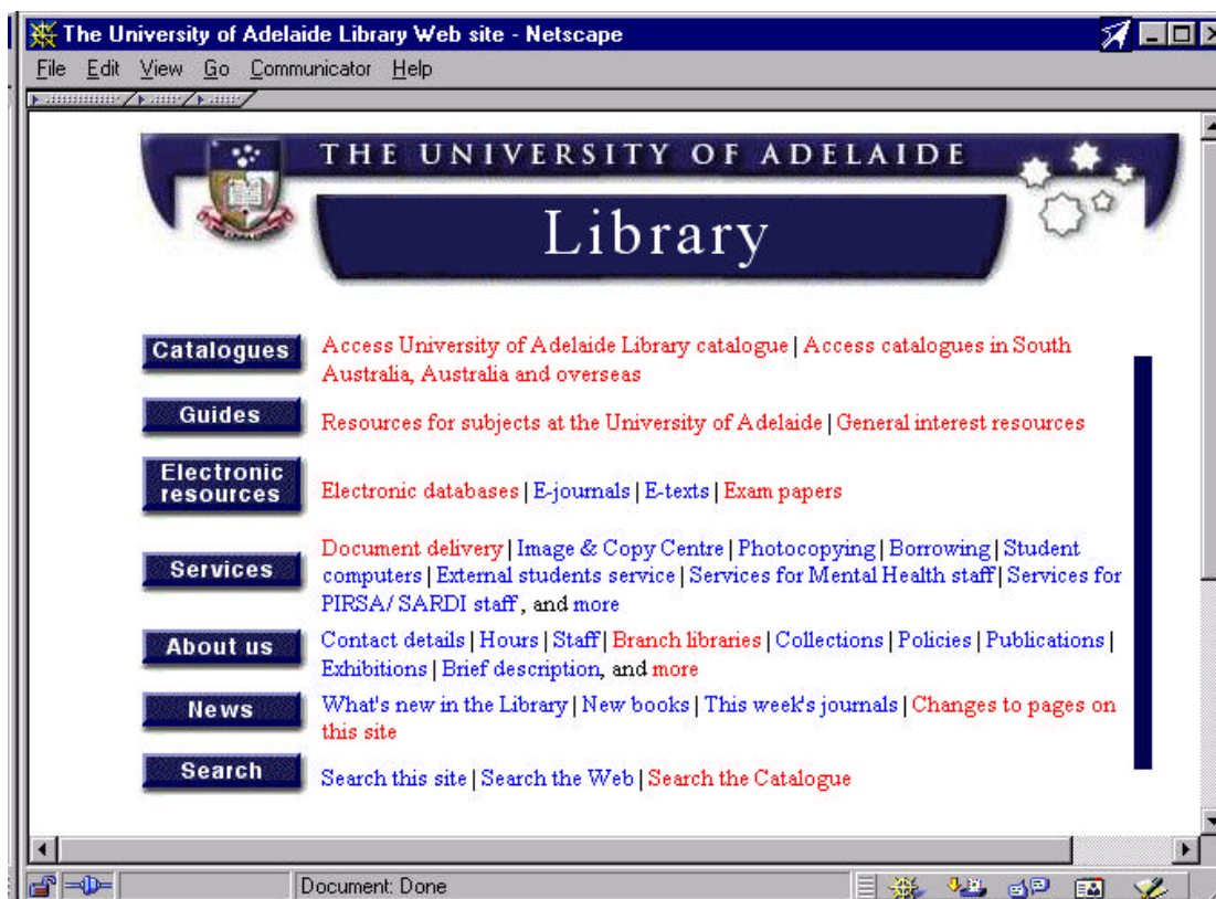
The Library's Website welcome page — easy access to electronic resources

Catalogue Plus! terminals will be available to authorised members of the Adelaide University community, and will require ID Card barcode authentication.