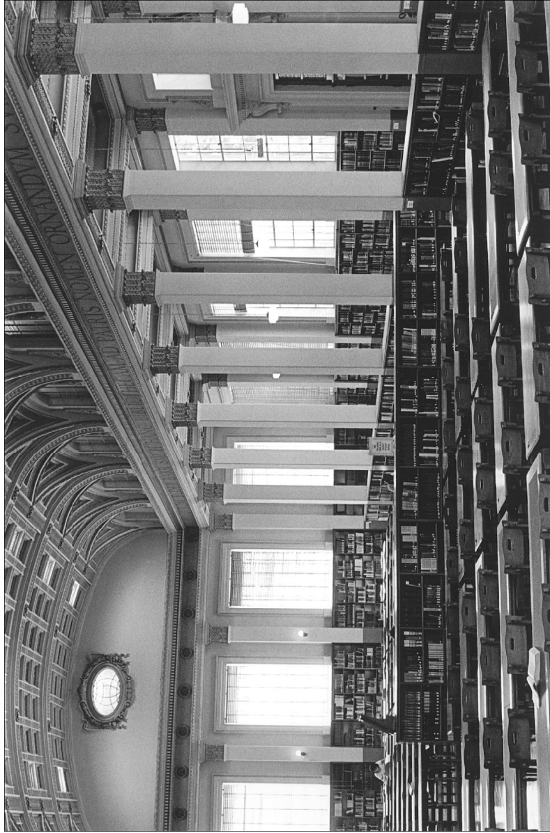
Photograph: Gilbert Roe