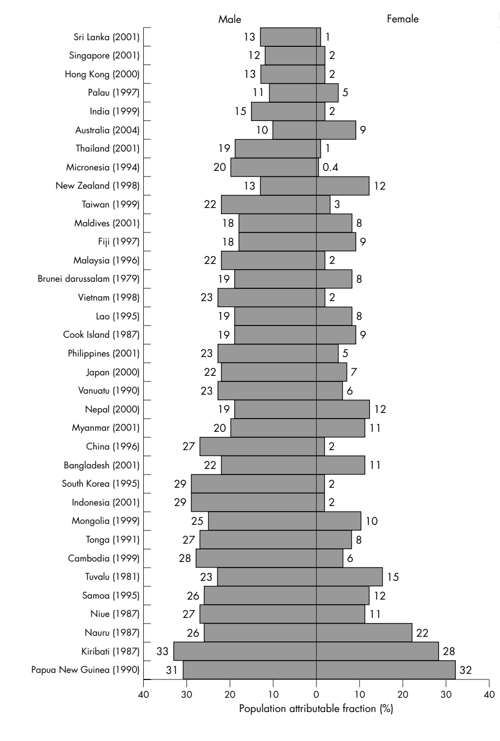
Figure 2 Population attributable fraction (%) of heart disease caused by smoking.

in LMIC in these regions is expected to increase in the coming years.<sup>2</sup> The attributable fractions for CVD for Australia and New Zealand from this study are similar to estimates previously published by Peto et al in their monograph providing PAFs for various outcomes caused by smoking in developed countries.<sup>17</sup> However, the methods used here are more direct and robust.