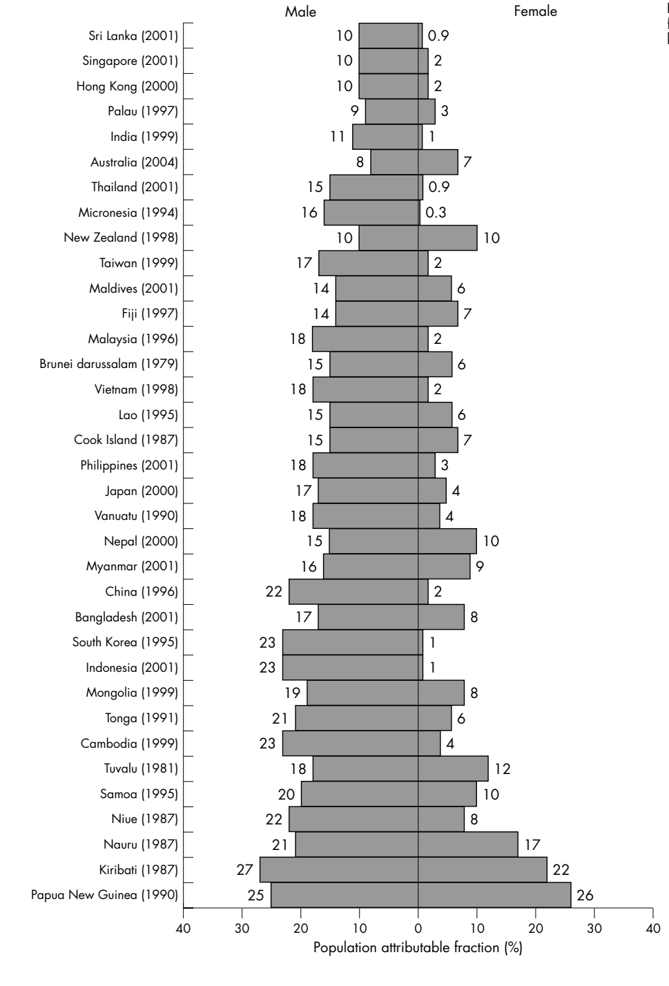
Figure 4 Population attributable fraction (%) of ischaemic stroke caused by smoking.

methods to verify CVD outcomes, and the lack of standardisation could have some effect on the estimation of the HR. Of particular importance for the current study is that only 57% of fatal strokes were classified by subtype and, while pathological diagnoses were verified by imaging or autopsy, limited information was available from many studies.