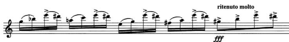
Figure 14 Lowell Liebermann, Soliloquy for Solo Flute Op. 44 , King of Prussia: Theodore Presser, 1994 (page 6, line 4).

A second questionable accidental is found on page 6, line 4 (see Figure 14). At the commencement of the fourth line the flautist plays a B flat and at the conclusion of the line, a B is notated without clarification. Without indication of a natural the performer should play another B flat, however in order to remain with the minor third pattern and with consideration to a later notated B flat, this was performed by the author as a B natural.