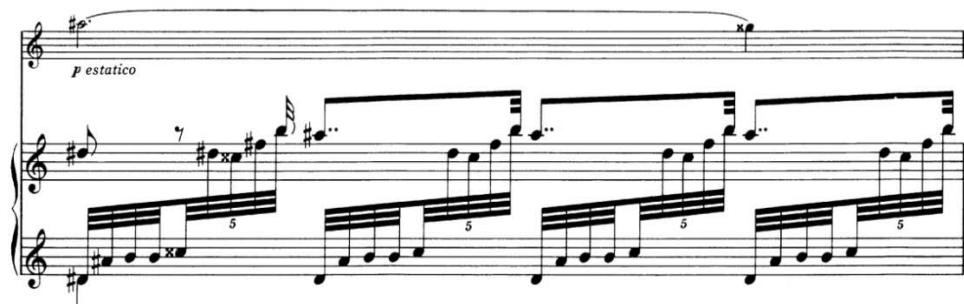
Figure 3 Lowell Liebermann, Sonata for Flute and Piano Op. 23 . King of Prussia: Theodore Presser, 1988 (1 st Movement, bar 62).

During interpretation of a new work, the performer can be unsure of the composer's intentions indicated by the markings in the music. One example of such an indication found in the Sonata is the estatico marked at bar 60 (see Figure 3). Research has shown that this marking is interpreted differently by many flautists. Liebermann stated that this section of the work calls for a transparency in the tone and an “ethereal sound” with an “airy” quality. In particular he suggests that a flautist draw this feeling from the piano's running lines beneath (refer CD 3 – track 3, 1:15).