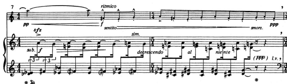
Figure 8 Robert Beaser Variations for Flute and Piano , Miami: Helicon, 1982 (Variation 1, bars 7-8).

Beaser suggested that at bar 8 and bar 31 a “percussive” articulation should be used for the staccato quavers (see Figure 8). Beaser has marked these with ritmico and sentito . So in respect to these markings these quavers must be rhythmic and by the use of this percussive articulation they will be better heard as they descend in the lower register (refer CD 1 – track 3, 1:50).