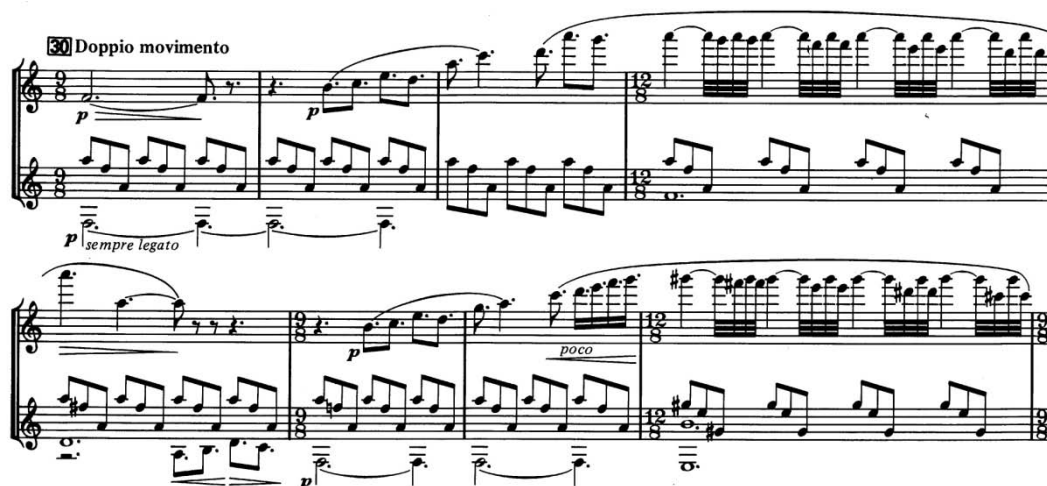
Figure 15 Lowell Liebermann, Sonata for Flute and Guitar , Bryn Mawr: Theodore Presser, 1993 (1 st Movement, bars 30-37).

The Sonata for Flute and Guitar Op. 25 by Lowell Liebermann presents many similar challenges to the flautist as the Sonata for Flute and Piano Op. 23 previously discussed from the perspective of the composer and performer. The long sustained phrases, soft dynamic indications and the wide use of all registers of the flute are found in both of these works and the need for “conceptualising” xxiv the flute and guitar together, suggested by Liebermann for the Sonata for Flute and Piano Op. 23 is particularly important for achieving the directionality of phrasing and creating the many contrasts in this work. This conceptualisation becomes increasingly important in the change of metre that occurs in the Theodore Presser edition between figure 30 and figure 60 (see Figure 15) and again on the return of this same idea at figure 80 (refer to CD 1 – track 1, 2:40).