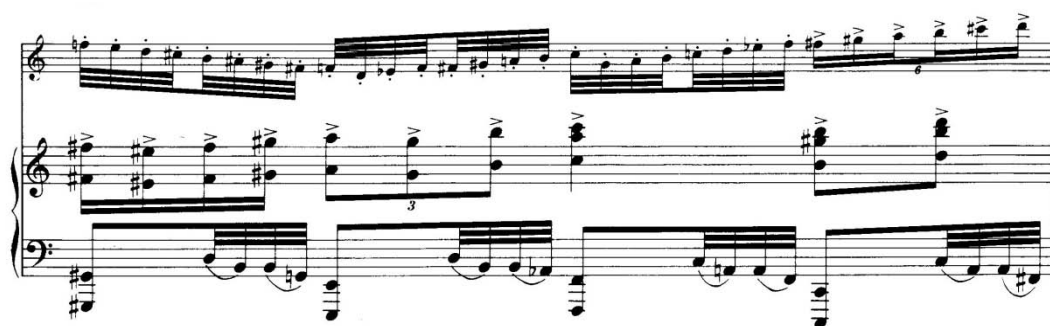
Figure 1 Lowell Liebermann, Sonata for Flute and Piano Op. 23 . King of Prussia: Theodore Presser, 1988 (1 st Movement, bar 32).

For the performance of twentieth and twenty-first century music, a flautist must be particularly careful not to make decisions to alter any specific dynamic markings or the register of the instrument from that indicated until they are fully aware of the composers intentions and have considered all possibilities for greater projection of sound and clearer articulation. Liebermann also emphasised the importance of balance and observation of the indicated dynamics, commenting on a number of occasions within the Sonata where the flute is at times not heard clearly beneath the piano due to the low register and dynamic level indicated. Liebermann stated that these sections are “intentional” and that they should not be altered to “be heard”, rather the flute should “emerge from the piano texture”. At bar 32 in the first movement for example (see Figure 1), where the flute is in the low register with a heavy texture in the piano, Liebermann stated that he “knew that the flute would be covered at the bottom” when he wrote it and that the choice of register was “completely intentional”. He also stated that the work is “very much a duo sonata and at certain points, the flute is definitely accompanying the piano”.