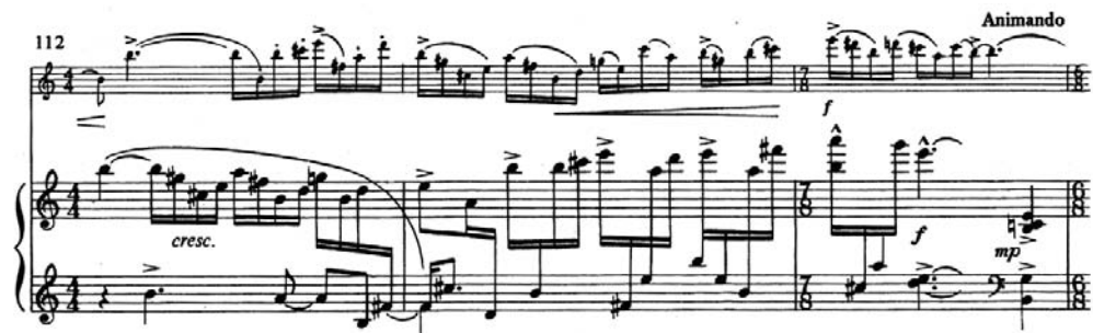
Figure 10 Robert Beaser Variations for Flute and Piano , Miami: Helicon, 1982 (Variation 3, bars 112-114).

At bar 112, it was stated that the flautist can “take time” in this bar, ensuring the first beat is expressive at bar 113 in preparation for the dolce ‘broader’ section at bar 115 (see Figure 10) (refer CD 3 – track 21).