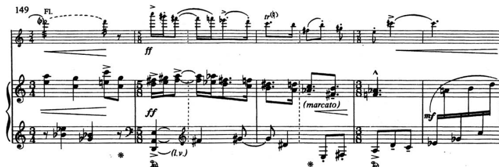
Figure 11 Robert Beaser Variations for Flute and Piano , Miami: Helicon, 1982 (Variation 4, bars 149-153).

Beaser explained that at bar 150 the flautist needs to “lay into the instrument more” and that the sempre fortissimo must be reached (see Figure 11). He stated that at the meno mosso (bar 166), the flautist should take time in this bar before returning to the original tempo at bar 167.