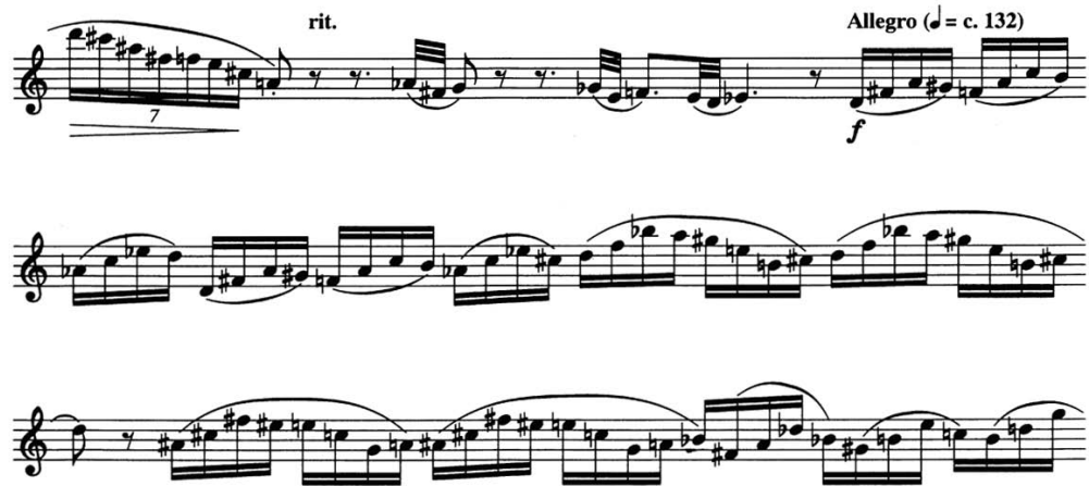
Figure 6 Lowell Liebermann, Soliloquy for Solo Flute Op. 44 , King of Prussia: Theodore Presser, 1994 ( Allegro , page 4).