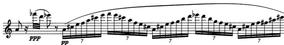
Figure 13 Lowell Liebermann, Soliloquy for Solo Flute Op. 44 , King of Prussia: Theodore Presser, 1994 (page 4, line 5).

The difficulty encountered in the interpretation of this work is found on line 5 of page 4 in the Theodore Presser edition (see Figure 13). A question was raised by this performer as to whether the second third register E is in fact an E flat or an E natural. As it appears on the score with the absence of bar lines or clarification, the flautist should perform an E flat observing the previous E flat accidental. On the same line however, there is a marked E flat accidental in the next grouping of notes. This led this performer to conclude that the note in question was in fact an E natural due to the following indicated E flat and the descending harmonic sequence.