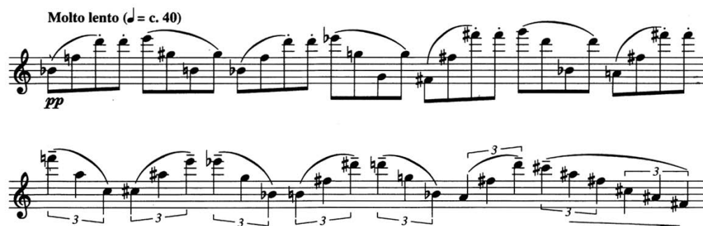
Figure 5 Lowell Liebermann, Soliloquy for Solo Flute Op. 44 , King of Prussia: Theodore Presser, 1994 ( Molto lento , page 4).

The first tempo consideration that was discussed with the composer was the Molto lento (see Figure 5). A performer may find the Molto lento lacks direction in the phrase at the tempo indicated. According to Liebermann, this section is “to be played with a lot of rubato ” and the “implied counterpoint is meant to be brought out”. He stated that most often it “isn’t the slowness of the tempo”, but rather the “way someone is approaching it”.