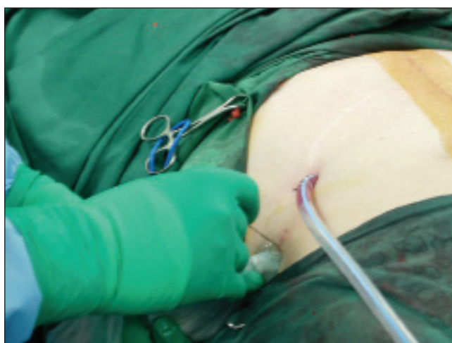
Figure 1: Tuohy needle (18-G) inserted anterior to Ultrasound transducer, which is held transversely in plane to perform the TAP block

There were no differences in age, sex, or the American Society of Anesthesiologists (ASA) classification between the groups. The pain scores and rescue analgesia are shown in Tables 1 and 2. Median pain scores were consistently lower in the TAP group, but only significantly so on days one and two on coughing and that on day two at rest. Rescue analgesia was required in PACU in both groups, but it was significantly