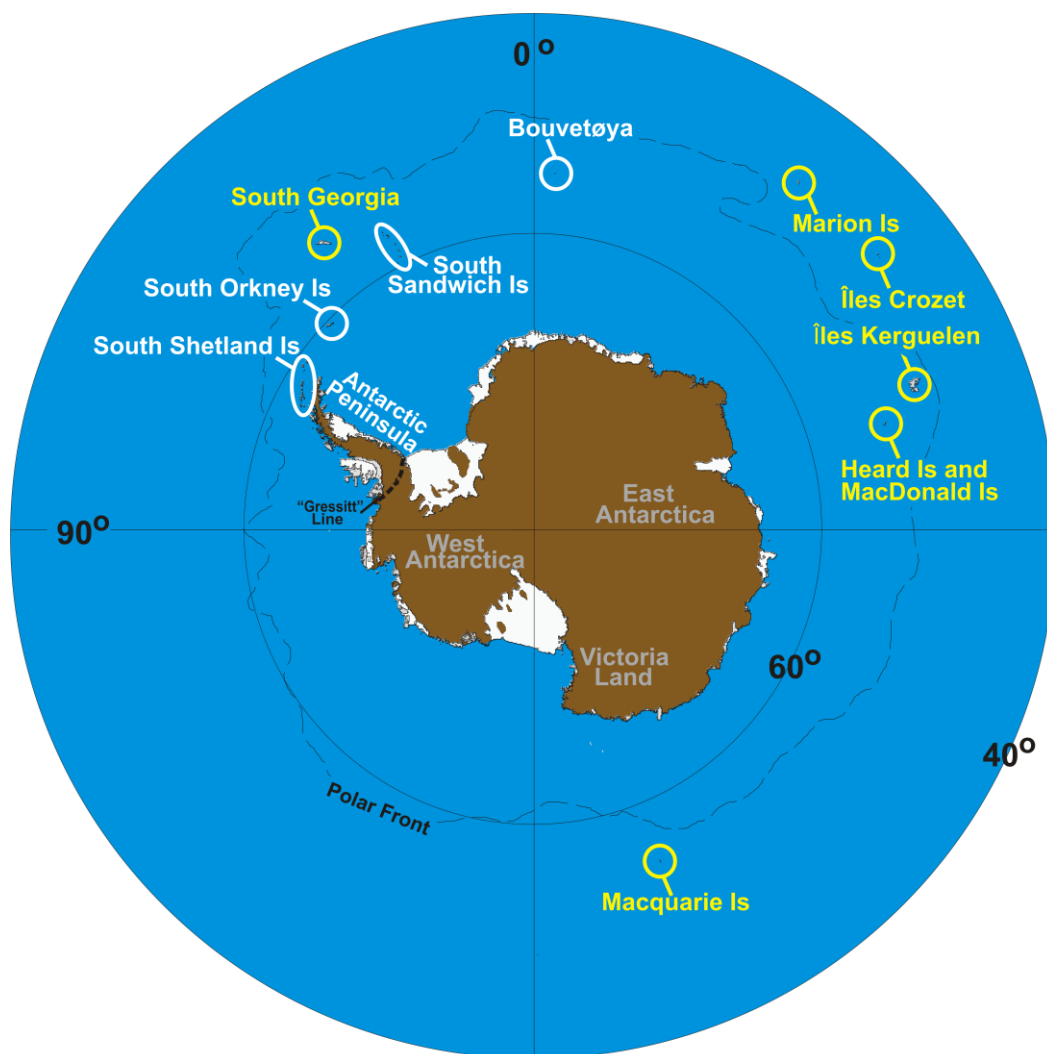
Figure 1. Map showing the different Antarctic zones and locations referred to in the text. Each zone is indicated by colour: yellow corresponds to sub-Antarctica, white to maritime Antarctica, and grey to continental Antarctica. In addition, the ‘Gressitt Line’ is shown at the base of the Antarctic Peninsula (see text).

Throughout each of these zones, springtail diversity is relatively well known, and up to 25 species of Collembola have been described [52]. However, just seven species have been the focus of phylogeographic studies (largely due to logistical and financial constraints). This includes three continental Antarctic species, one continental/maritime Antarctic species, and three species from the maritime Antarctic.