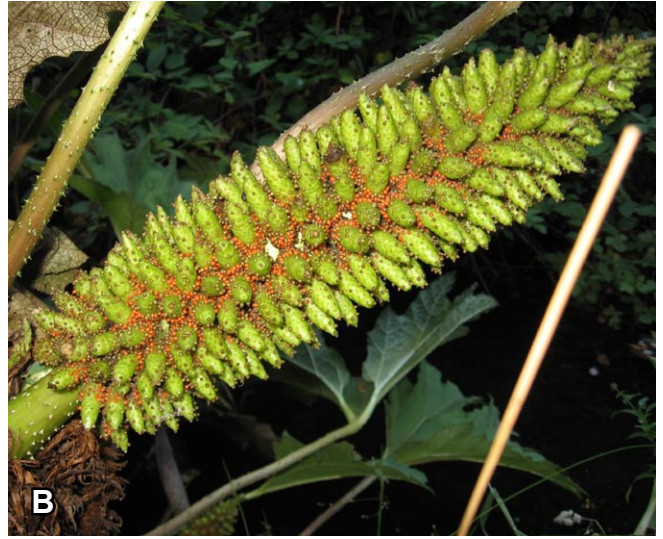
Pl. 1. Gunnera tinctoria . A , two mature plants growing along Sturt Creek, Adelaide Hills; scale bar: 10 cm intervals. B , Inflorescence, ripe fruits orange.