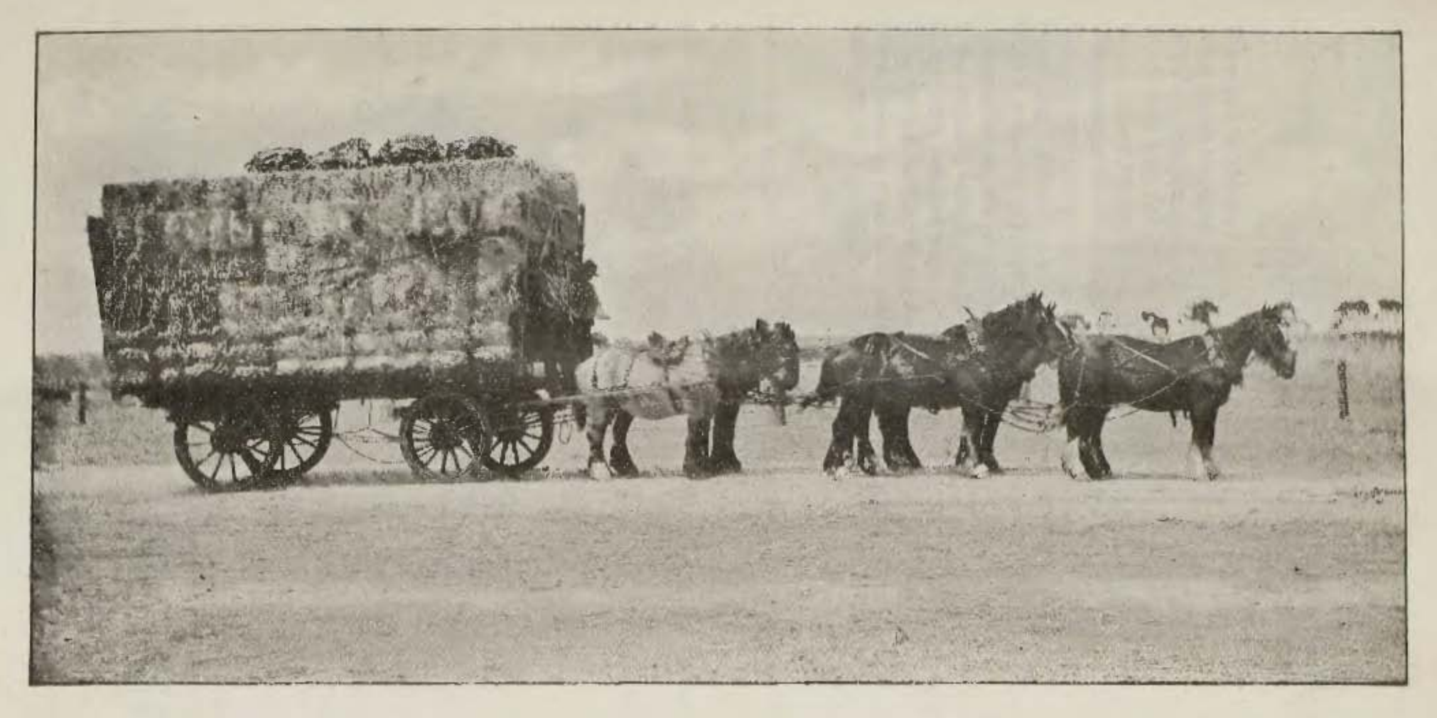
COLLEGE TEAM CARTING PRESSED STRAW.