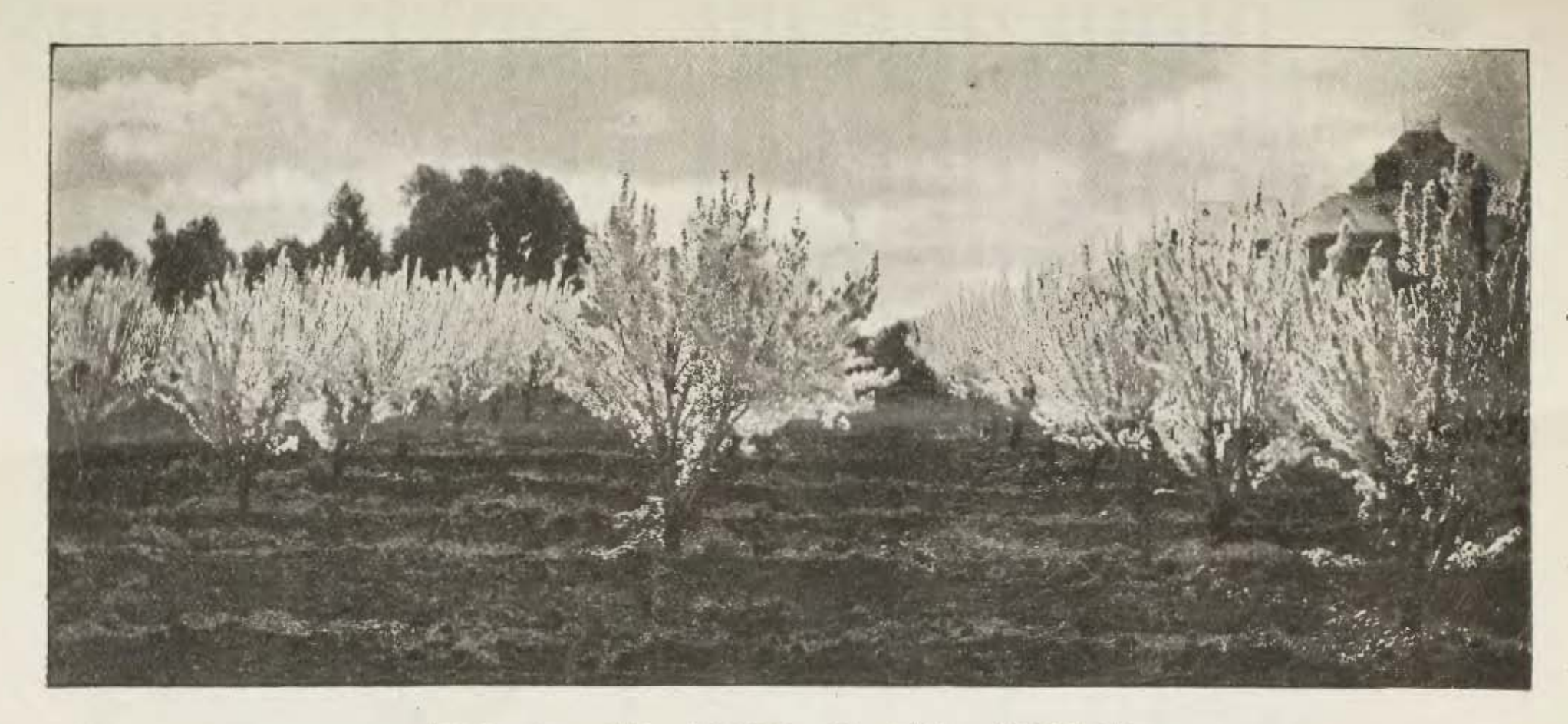
THE ALMOND TREES AT THE COLLEGE.