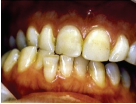
FIGURE 7: An extreme lateral mandibular movement past the canine edge-to-edge has resulted in the notch on the upper right central incisor.

The mandibular movement during grinding results from a lateral movement where the lower canine tends to ride along the palatal surface of the upper canine and past the canine-edge-to-edge position into an eccentric position. Here, one condyle pivots at the postglenoid tubercle (ipsilateral), while the contralateral condyle moves anteriorly, medially and inferiorly along the condylar eminence due to the unilateral action of the lateral pterygoid muscle. The resulting microwear striations are generally seen on the wear facets of anterior teeth, but they also become evident on the posterior teeth where the group function is present. These striations have been described as transverse and oblique on posterior teeth and anterolateral on anterior teeth [27].