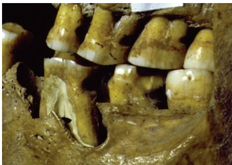
FIGURE 2: The passing of kangaroo tendon between posterior teeth caused distal abrasive wear called “interproximal grooving.”

2.4. Helicoidal Plane. This occlusal characteristic has been documented by anthropologists in different human populations and has been described as a posterior occlusal twist of worn occlusal surfaces [21, 22]. Here, the occlusal surfaces of the lower first molars slope towards the buccal, the second molars are horizontal, and the third molars slope lingually (Figure 4). The opposing teeth follow the reverse pattern. This alteration in the occlusal curvatures can also occur in modern societies where there is advanced dental wear, but these changes often go unnoticed.