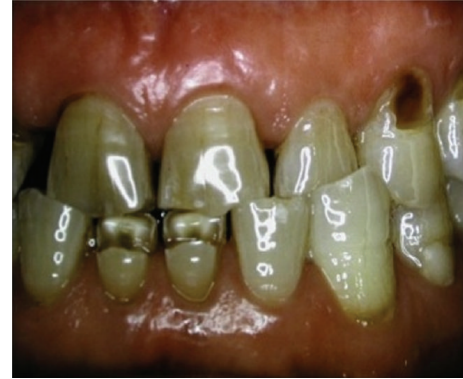
FIGURE 8: Two wedge-shaped lesions have formed on the lower first central incisors. To date there is no definite explanation as to the cause of the wear pattern.

There are occasions when tooth wear patterns are observed without any obvious explanation, even after thorough questioning of the patient. An example is depicted in