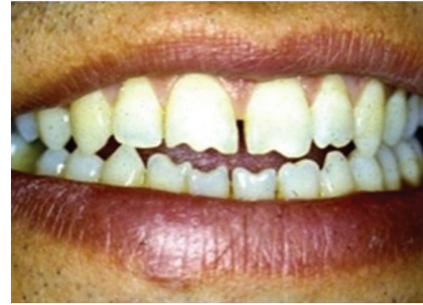
FIGURE 5: The “vertical” positioning and crushing of pumpkin and watermelon seeds using the anterior teeth has resulted in the abrasion “notches” in those teeth.

So-called contemporary, modern or post-industrial populations tend to show wear characteristics that are different to those of our ancestors. As a general rule, the wear caused by abrasive food is much reduced in modern societies because of our softer, more processed diets. However, there