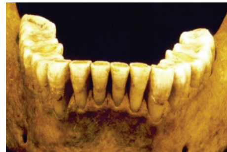
FIGURE 4: The helicoidal plane. The wear pattern produces an occlusal twist of the molar teeth. The buccal inclination on the first molars changes to a neutral inclination on the second molars that in turn changes to a lingual inclination on the third molars.

corresponding remodeling of the glenoid fossa also tends to occur [24].