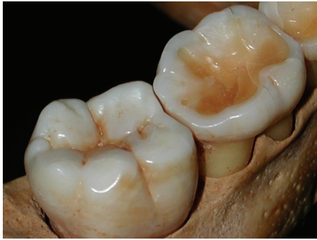
FIGURE 1: Interproximal wear in a young child. The mesial of the permanent first lower molar wears faster than the distal of the primary second molar.