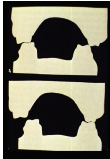
FIGURE 3: An example of “X-occlusion” or “alternate intercuspation.” The plaster models sectioned coronally across the molars highlight the two types of centric occlusions.

2.5. Form and Function, Differential Wear, and Occlusion. Contrary to belief within some dental circles, dental occlusions are dynamic and continually changing. Tooth wear, particularly abrasion in precontemporary hunter-gatherer populations, is the main mechanism that changes the morphology of teeth over time. A “canine-protected” occlusion during youth tends to change progressively into “group function,” causing a number of consequential adaptive changes [23]. As the wear progresses, continual eruption of teeth compensates for the wear (a feature seen commonly in other nonhuman species as well). The established occlusal vertical dimension at any given point of time is, therefore, a by-product of these two opposing processes. As the cusps reduce in height and disappear, the “tear-drop” cycle of the masticatory stroke becomes wider and, with excessive wear,