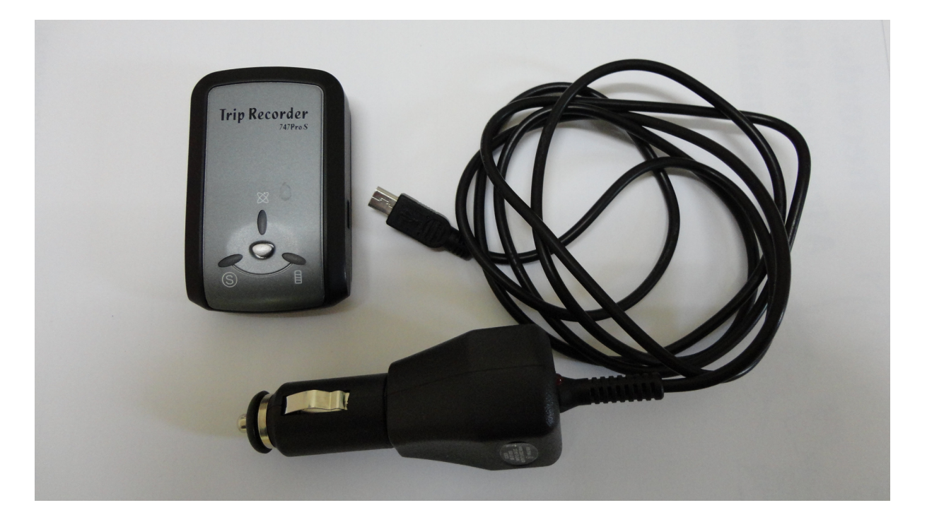
Figure 1. Digital photograph of the 747ProS GPS Trip Recorder shown with the car charger.

The Trip Recorder has a rechargeable battery, which provides 30 hours operation time and 300 hours standby time. When attached to the vehicle's AC power using a car charger, however, it has a setting that synchronises its operation with the vehicle's ignition. Thus, it only records data when the ignition is on and the device is receiving power; when the ignition is off, it goes into standby mode. This reduces the consumption of the internal battery power, as well as continually recharging it. It also groups the data into separate 'trips' (i.e., a section of driving in which the vehicle was started at a certain location, driven and then stopped at a particular destination) because it starts recording when the vehicle is started and driven, and then stops when the vehicle is turned off. Moreover, by not operating continuously, it eliminates needless data. It also has a built-in motion sensor. When it is set to use this sensor, it will start recording data when motion is detected (i.e., when the car is in motion) and will enter standby mode when it is static for two minutes. This was useful for vehicles in which the AC connection was not working or was used for another purpose (e.g., charging a mobile phone). Use of this sensor prolongs the life of the internal battery and, as with the car charger, eliminates needless data and separates trips.