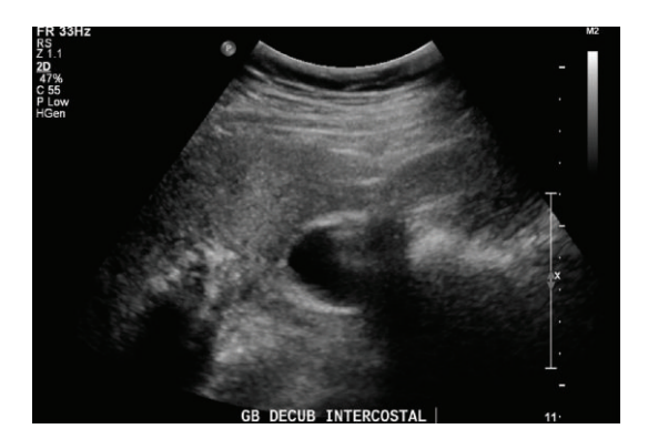
FIGURE 1: Abnormal gallbladder with thickened wall and mass in the fundus on ultrasound.