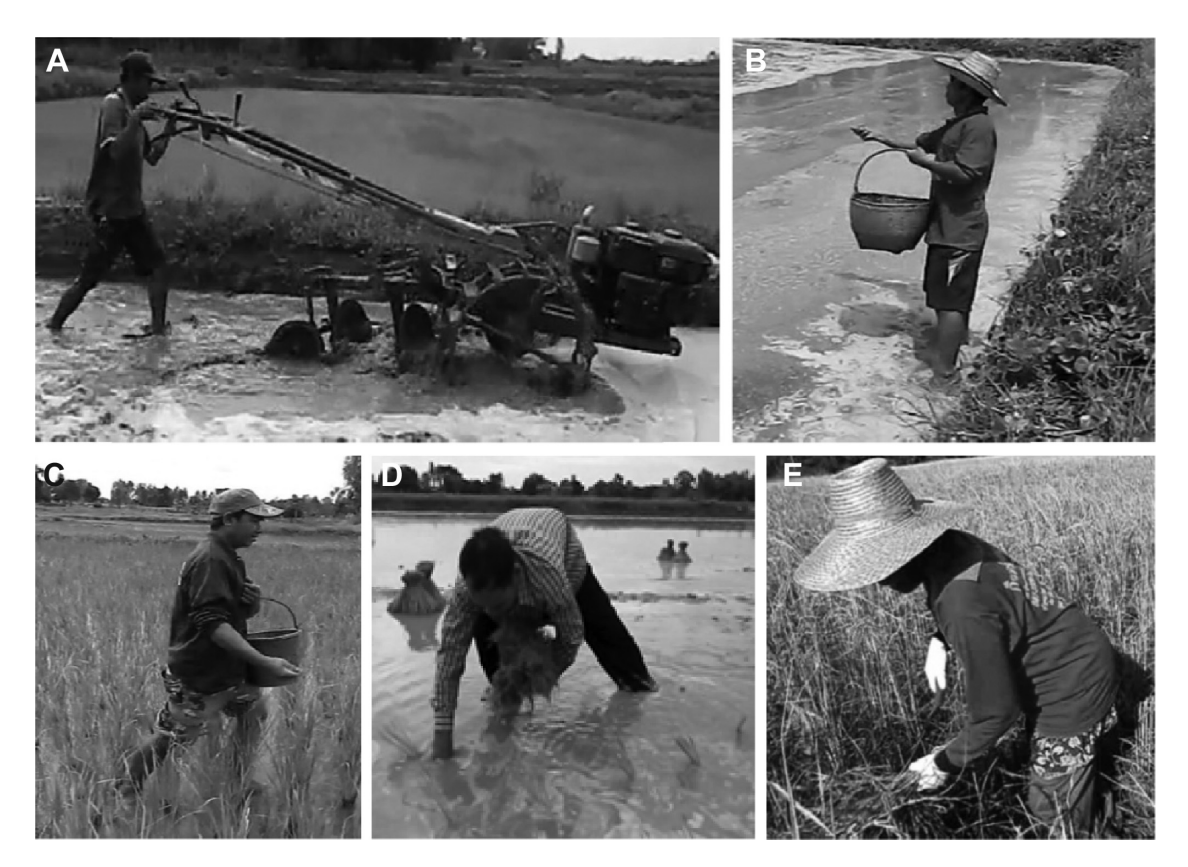
Figure 1 Typical rice cultivation processes including: (A) plowing; (B) seeding; (C) nursing and fertilizing; (D) planting; and (E) harvesting.

Females are generally exposed to a higher risk of lower extremity malalignment due to different anatomical alignment, lower pain thresholds, and lower physical tolerance than males.<sup>17–20</sup> Previous studies found that females are at increased risk of abnormal anterior pelvic tilt, femoral antetorsion, Q angle, tibiofemoral malalignment, and genu recurvatum.<sup>17,18</sup> However, the sex difference for limb