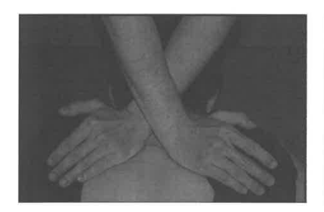
Fig.2. Single level thoracic manipulation (screw thrust technique) at both zygapophyseal joints of T6-T7

sides for 1 minute<sup>7)</sup>. The Grade III mobilization involved large amplitude motion at the limit of range of motion. This technique has been used for improved range of motion. The