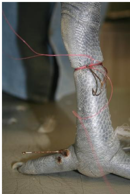
Figure 1. An Australian pelican with a fishing hook injury to the leg, with the attached line forming a ligature. Failure to remove the line may have resulted in deep infection and/or amputation.