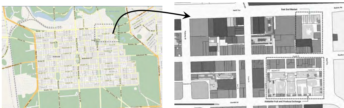
Figure 1: Case study area – Adelaide East End

The study area is bordered on two sides by parklands although to the north the parklands are largely built on with the hospital complex and university campuses. To the west is Rundle Mall, the main retail shopping strip of the city. Major roads that surround this area are: North Terrace, East Terrace, Grenfell Street and Pulteney Street. Within the area are an east-west street, Rundle Street, and Frome Street, which stretches north-south.