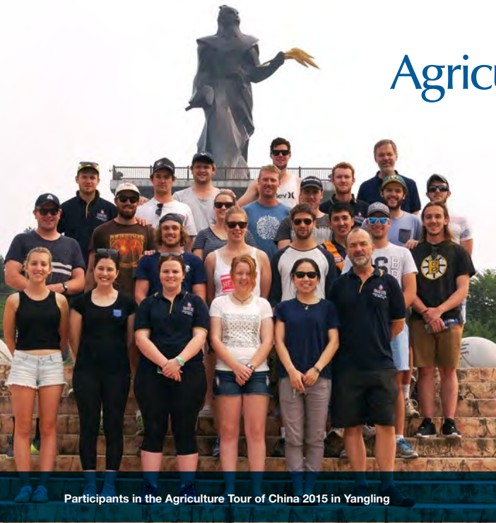
Participants in the Agriculture Tour of China 2015 in Yangling

Twenty two final-year students of Agricultural Sciences travelled to China on 4-20 July for an agricultural tour, the third year this tour has been run. The group visited and viewed a wide range of agricultural sites and activities, including beef feedlots, a sturgeon farm, a deer farm, the National Gene Bank, a Biotechnology Company, a large collective farm at Xinglongcun, and high-tech greenhouses in Beijing. They saw cultivation of maize, soybean, Chinese gooseberry (Kiwi fruit), wine grapes, dragon fruit, rice, conventional and organic vegetables, many kinds of mushrooms and lotus root.